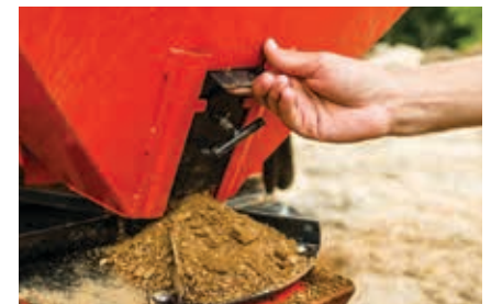
ADJUSTABLE FLOW GATES